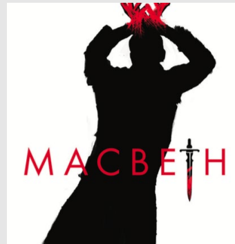
4/2 – Macbeth