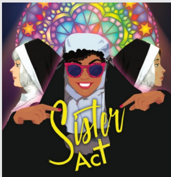
12/4 – Sister Act