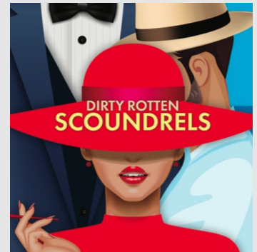
6/11 – Dirty Rotten Scoundrels

All Saturday matinee classes include the show, and start at 1:00 pm